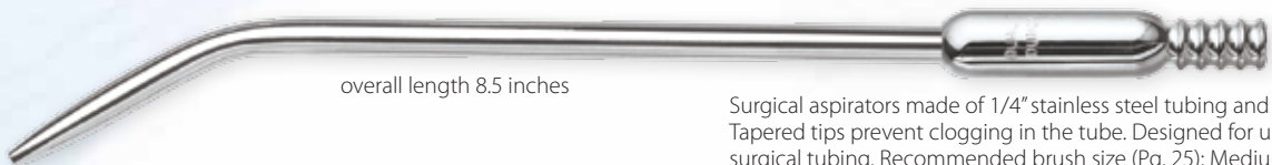
overall length 8.5 inches

Surgical aspirators made of 1/4" stainless steel tubing and are 8 1/2" long. Tapered tips prevent clogging in the tube. Designed for use with 1/4" surgical tubing. Recommended brush size (Pg. 25): Medium.