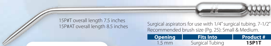
15P#T overall length 7.5 inches 15P#AT overall length 8.5 inches

Tapered tip helps prevent clogging in the tube.