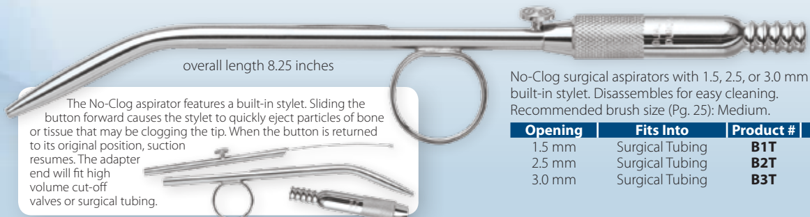
overall length 8.25 inches

The No-Clog aspirator features a built-in stylet. Sliding the button forward causes the stylet to quickly eject particles of bone or tissue that may be clogging the tip. When the button is returned to its original position, suction resumes. The adapter end will fit high volume cut-off valves or surgical tubing.